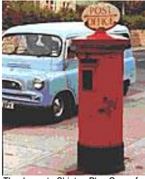
Thank you to Shipton Play Group for our lovely shiny letter-box!