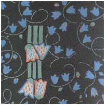
Detail from the inner sleeve of The Montana Stories by Katherine Mansfield, published by Persephone Books. http://www.persephonebooks.co.uk

Wednesday of every third month. This month (April) we are reading Family Roundabout by Richmal Crompton, better known for the Just William books. The next Persephone meeting will be on Wednesday July 15 th , when we shall be reading The Montana Stories by Katherine Mansfield.